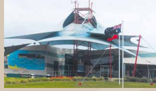
Penguin Parade shade structure Phillip Island, Victoria