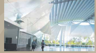
Redlynch Indoor Sports Centre Cairns, Queensland