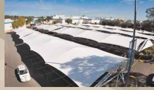
Shopping centre car park Brisbane, Queensland