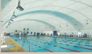
Olympic Swimming Pool Canberra, ACT